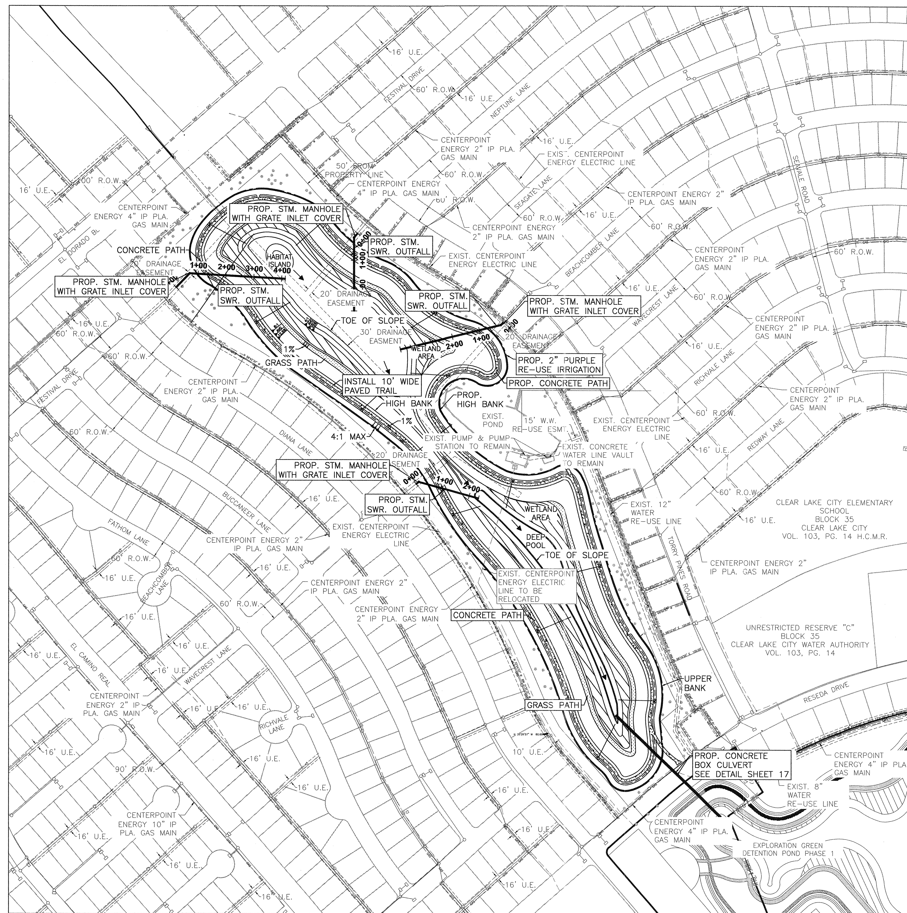
PROPOSED OVERALL LAYOUT